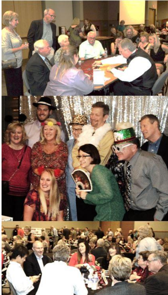
Gala entertainment included a casino, photo booth, silent and live auctions, and dinner.